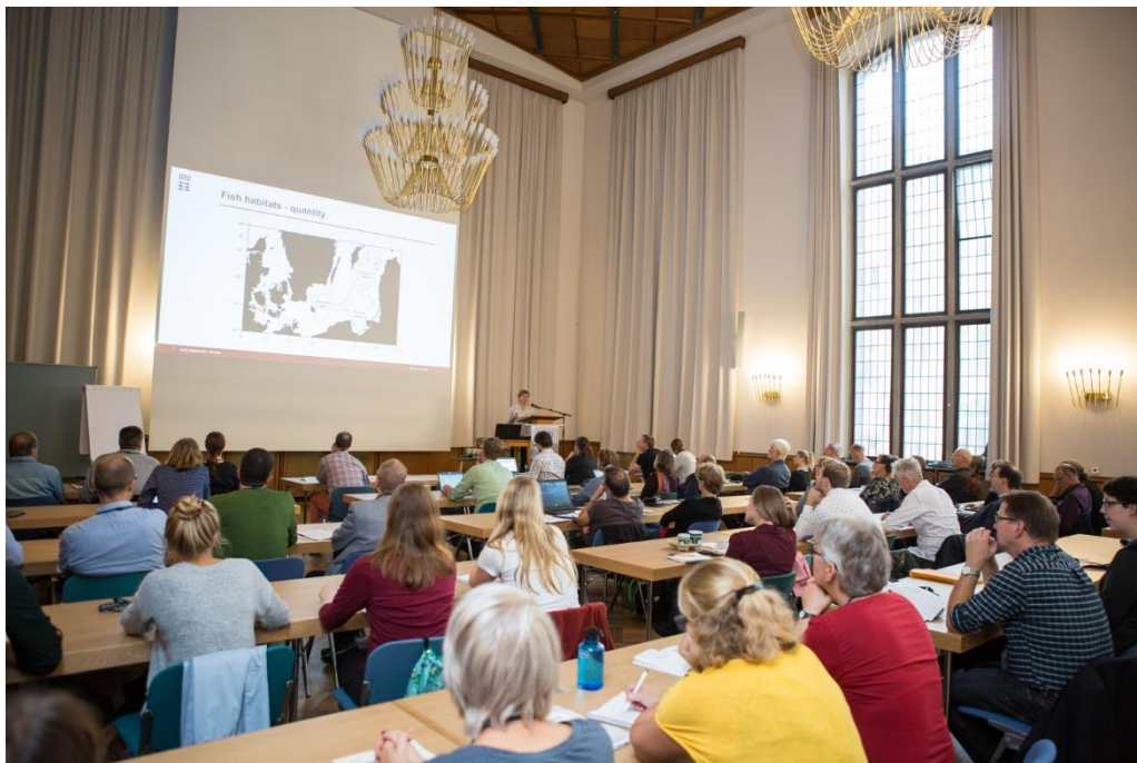
Habitat maps are the basis.