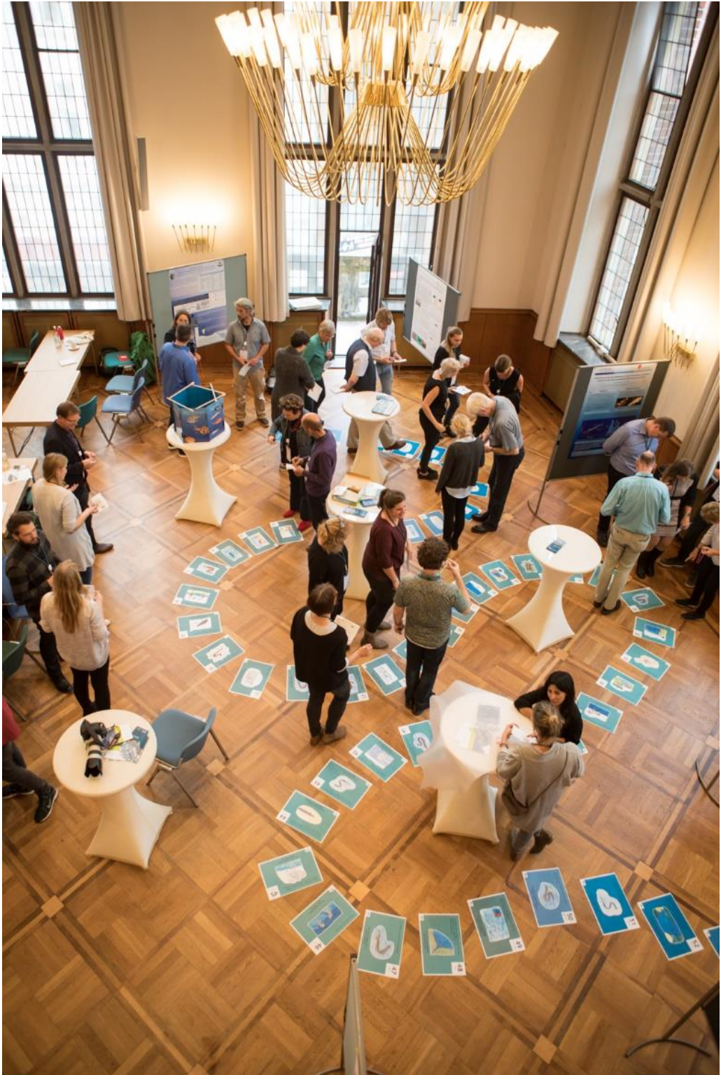
Travelling along an eels' formidable swimway: the eel game.