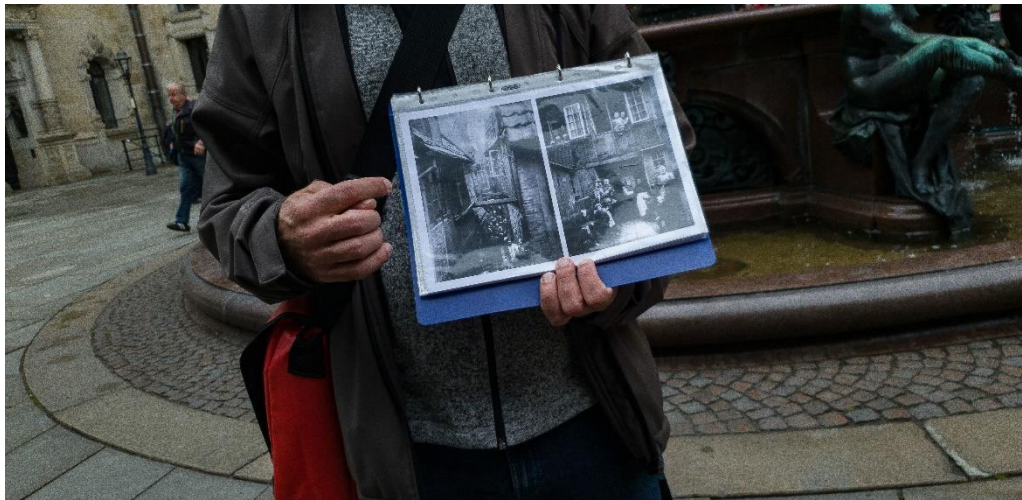
Participants of the post-conference guided tour from townhall to concert hall also passed the conference venue and learned several interesting things about it.