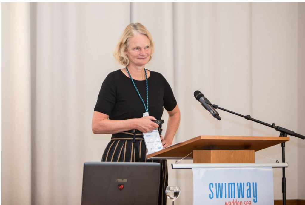
... and takes questions afterwards.