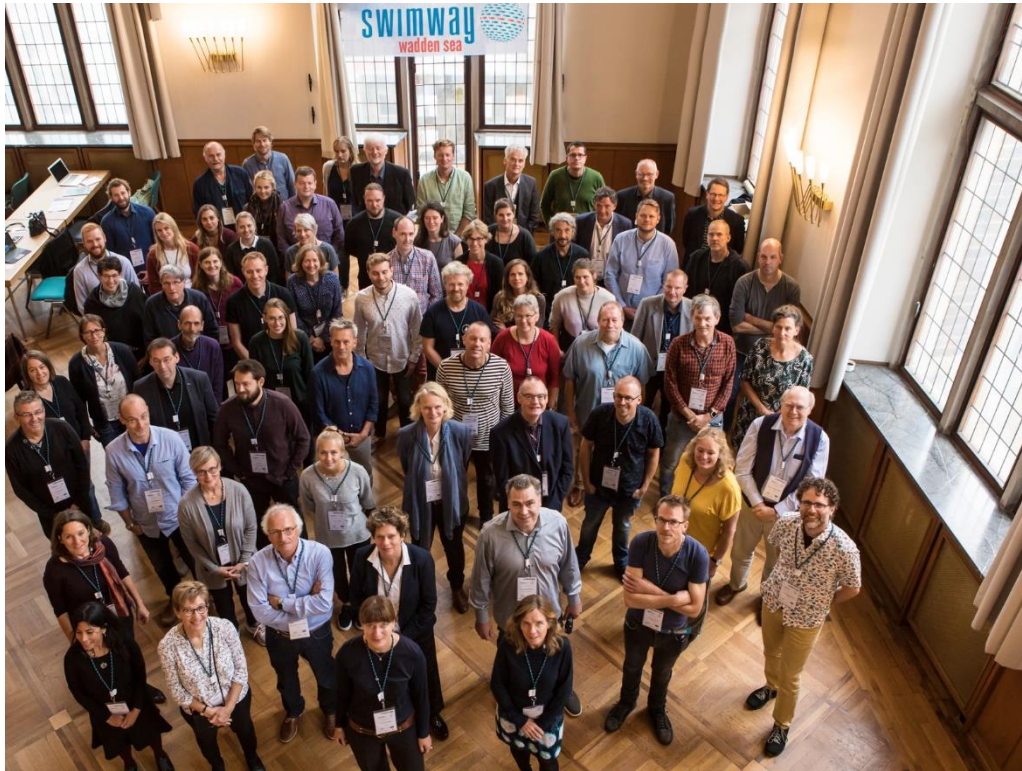
Participants of the SWIMWAY conference 2019, heads all up.