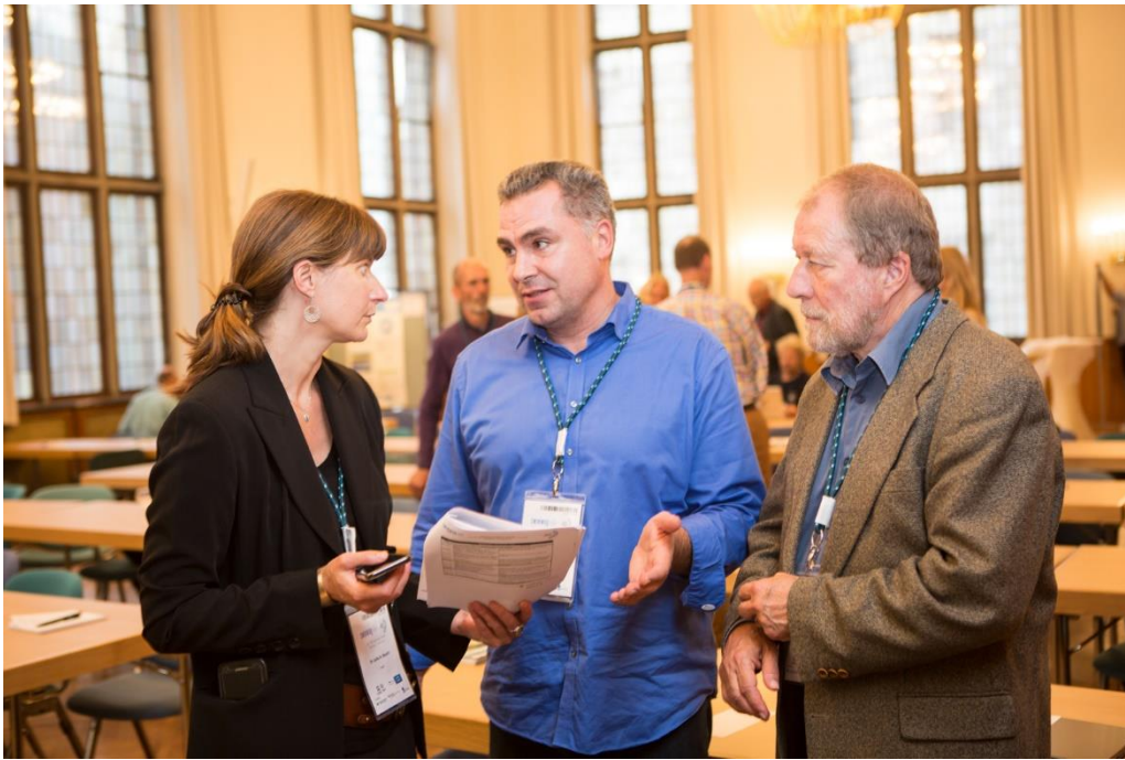
Three fifths of the SWIMWAY organising team in a spontaneous breakout session.