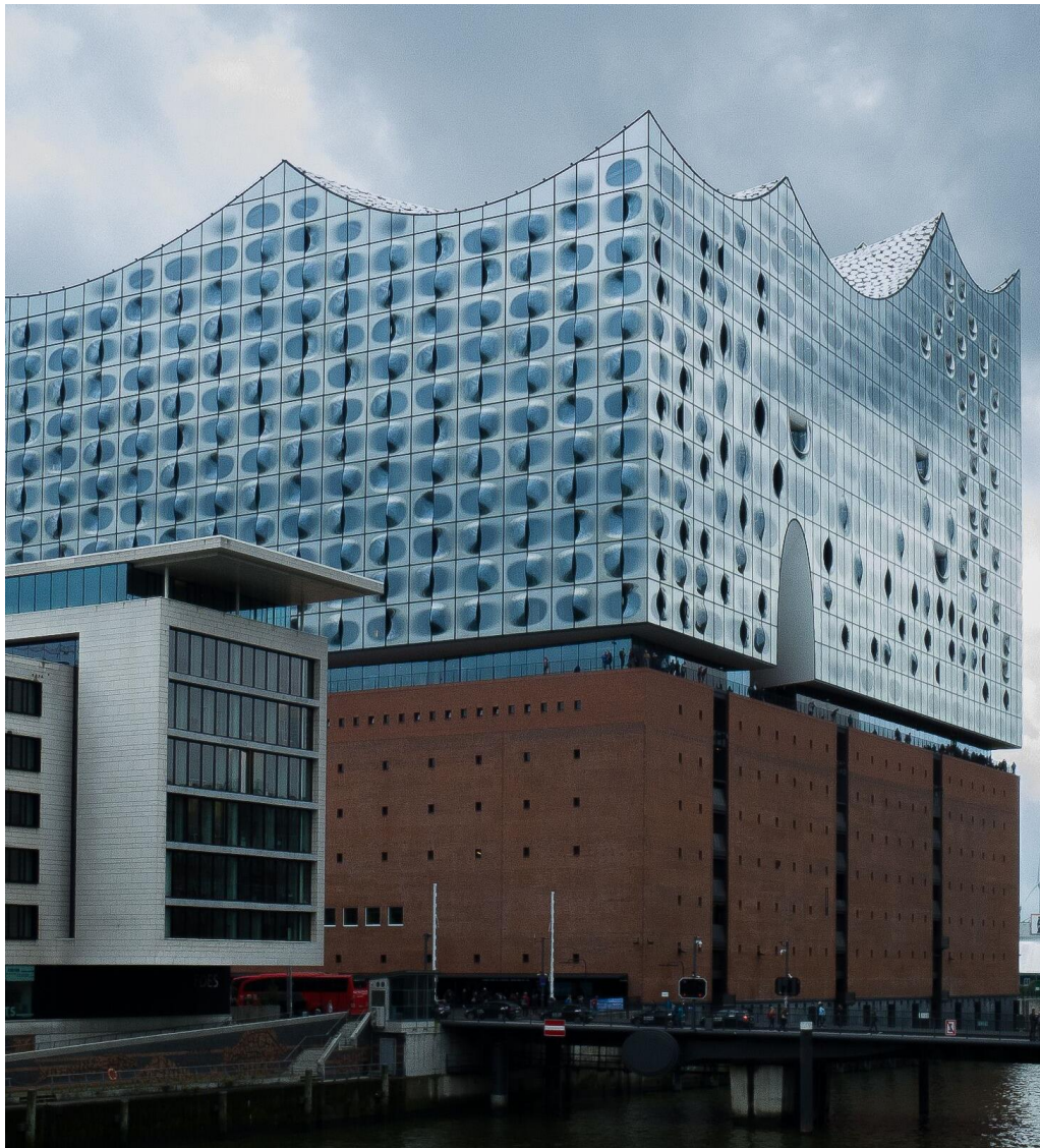
The new pride of Hamburg: Concert hall “Elbphilharmonie”.